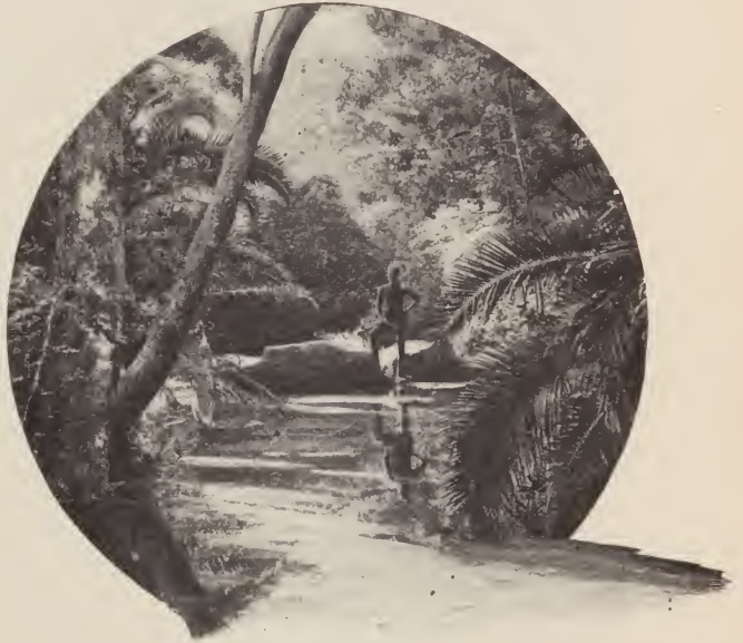
A GLIMPSE OF THE AFRICAN BUSH.

European nations have entered and divided the territory once under the sway of Chaka, so that it is now known by two distinct names, Natal and Zululand. Natal lies between 27^{\circ} and 30^{\circ} south latitude, about a thousand miles from Cape Town, while Zululand is northeast of Natal. Together they contain about 40,000 square miles and nearly a million people. The two districts are so similar that Dr.